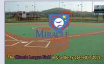
Audiovisual Communication: Cranberry Twp., Butler Co.