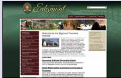
Websites: Edgmont Twp., Delaware Co.