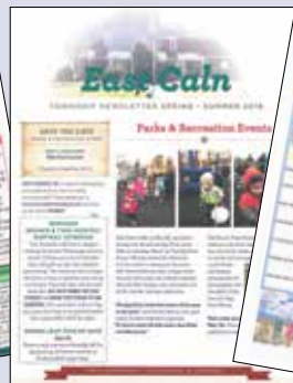
Population 2,001-5,000 Newsletters: East Caln Twp., Chester Co.