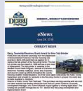
Electronic Newsletter: Derry Twp., Dauphin Co.