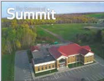
Other Publications: Summit Twp., Erie Co.