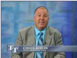
Cable TV Channels/Programs: Upper Merion Twp., Montgomery Co.