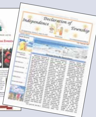
Population 2,000 and Under Newsletters: Independence Twp., Washington Co.