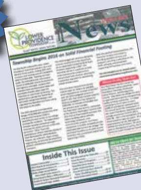
Population 10,001 and Over Newsletters: Lower Providence Twp., Montgomery Co.

Watch for details on the 2017 contest this summer!