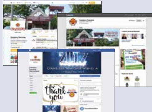
Social Media: Cranberry Twp., Butler Co.